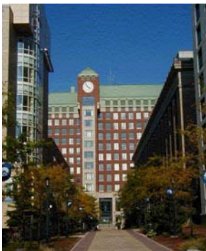
Case Western Reserve University School of Medicine Biomedical Research Building