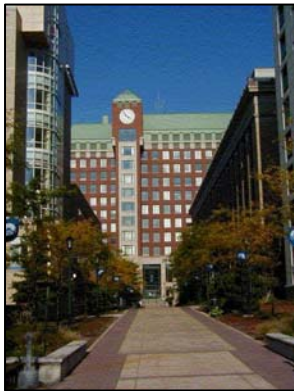
Case Western Reserve University School of Medicine Biomedical Research Building